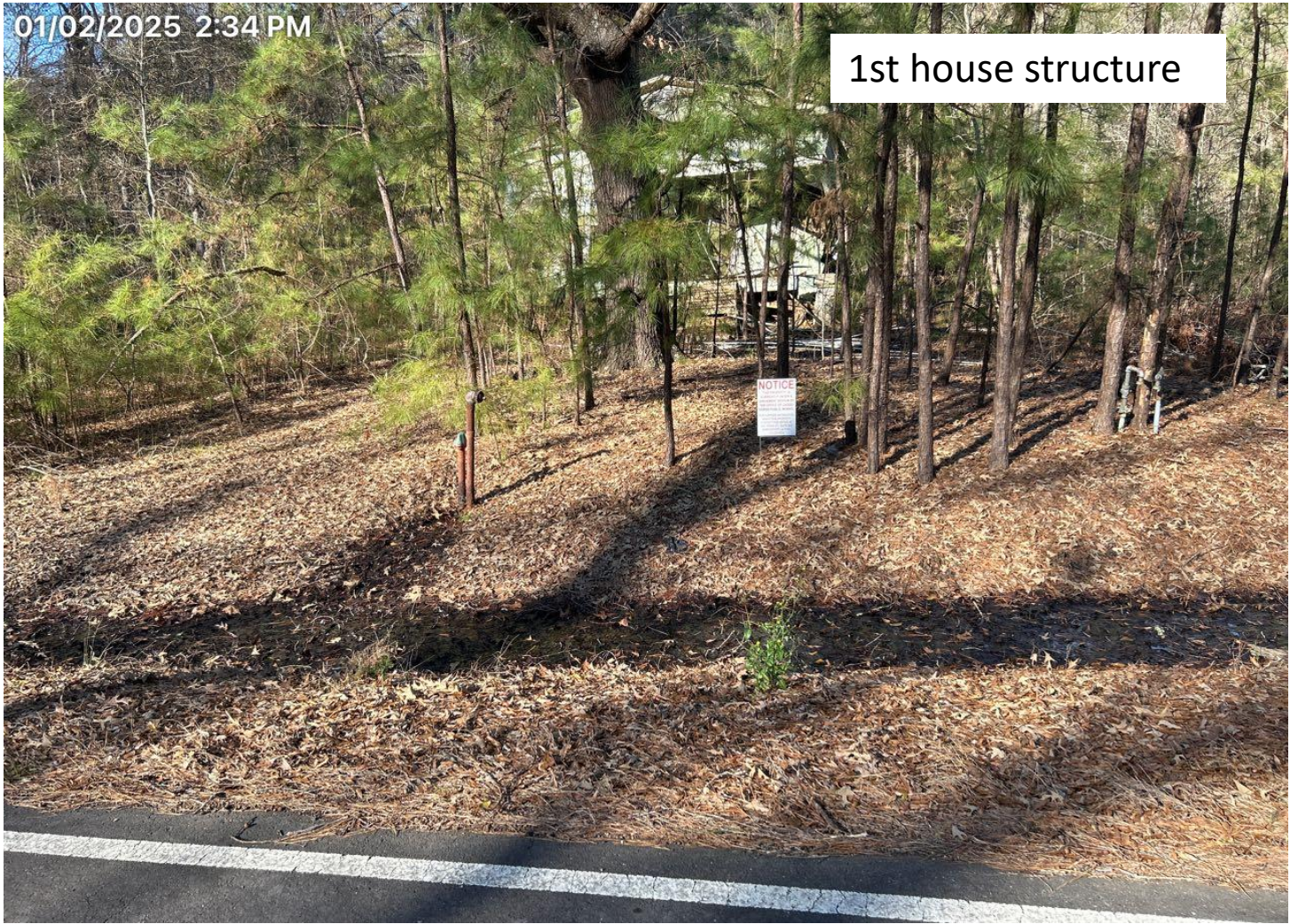
1st house structure