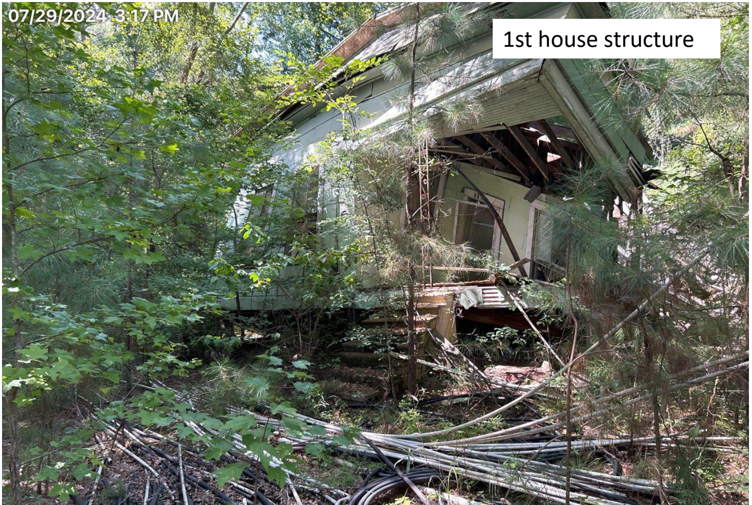
1st house structure