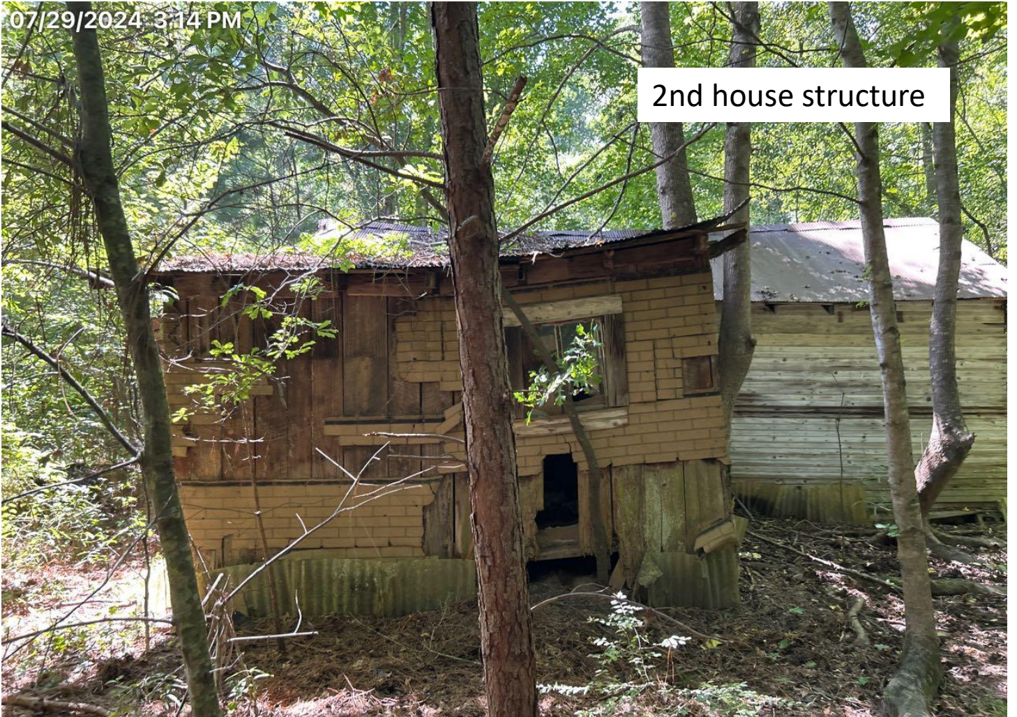
2nd house structure