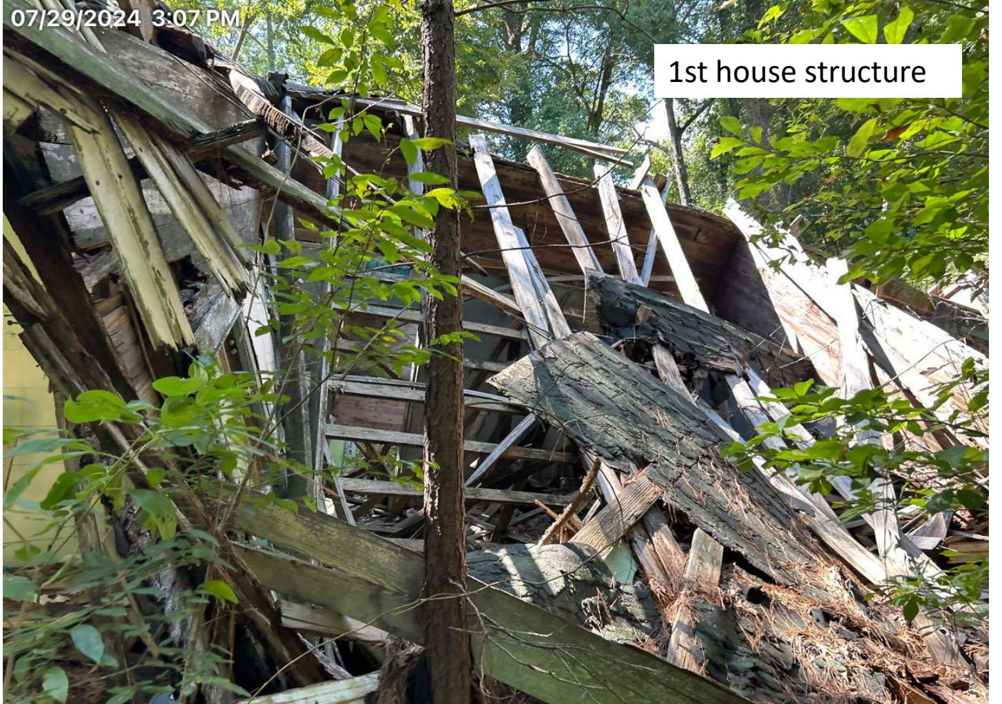
1st house structure