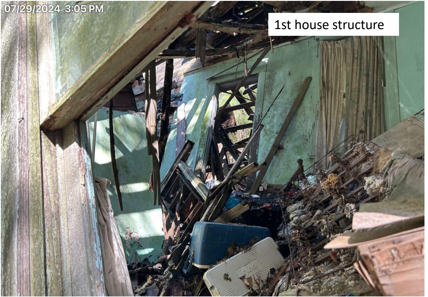
1st house structure