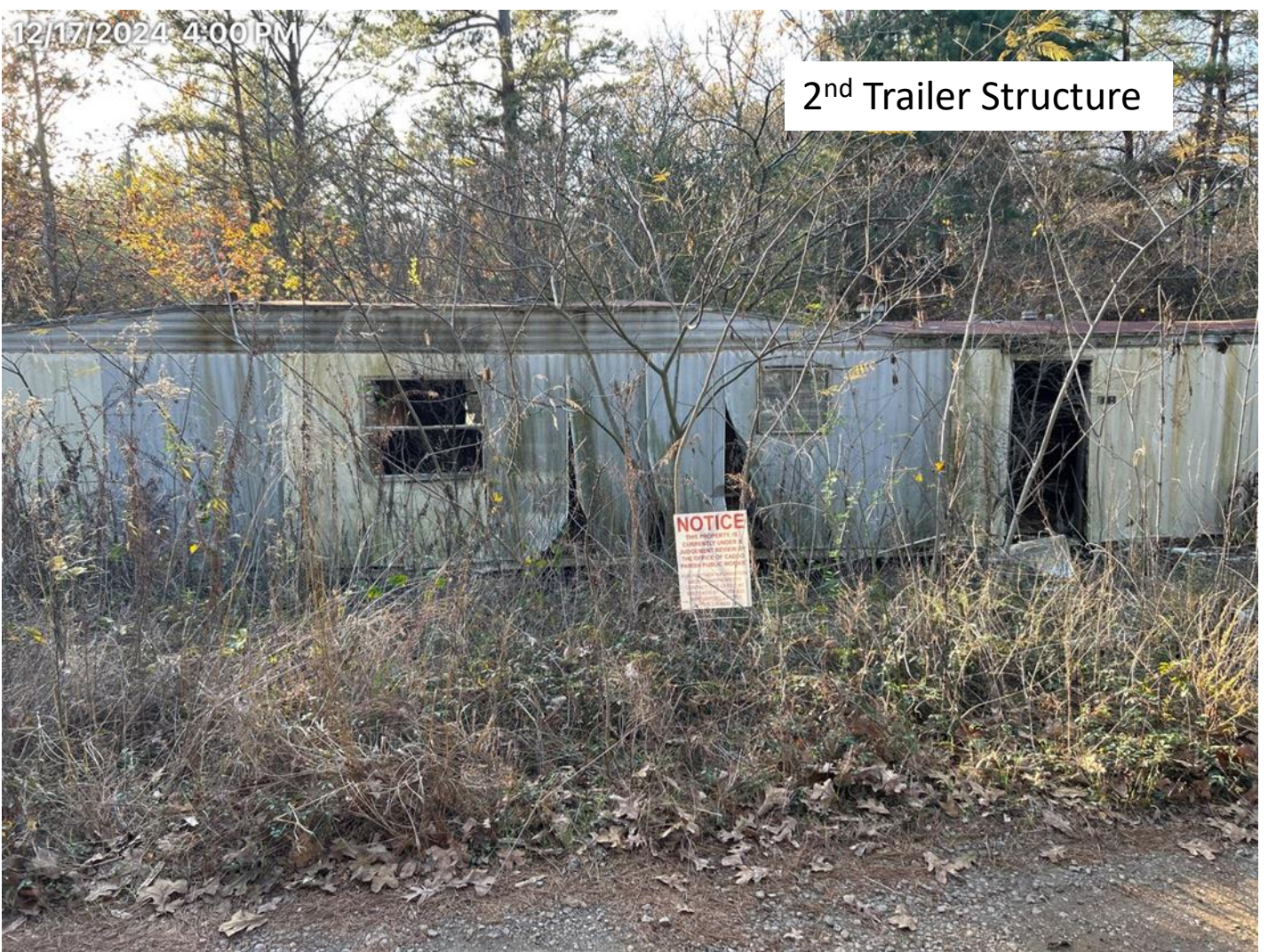
2 nd Trailer Structure