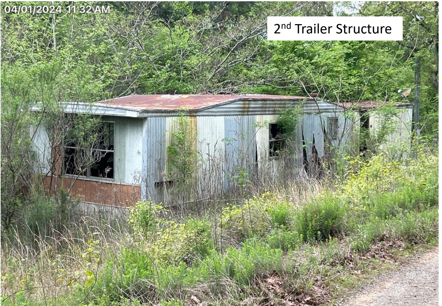
2 nd Trailer Structure